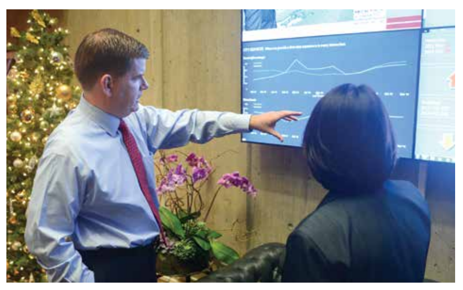
Mayor Walsh discusses trends in service delivery in the city of Boston.

President Eddinger: The College is going to be doing some training for the Green Line extension to help supply human resources for the project. Do you see an alliance of trainers across the city willing to do that to support the Green Line? Do we have that infrastructure right now?