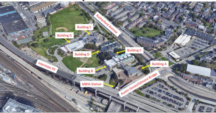
Graphic I: Aerial View

The Site consists of six interconnected campus buildings, with a seventh building currently under construction. The original campus, Buildings A, B, C, D, E and M (not shown) were completed between 1973 and 1979. Building G was constructed in 2009 and the Student Success Center (not shown) is currently under construction with an estimated completion date of 2024.